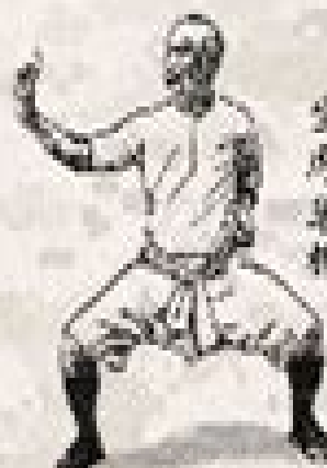
Deing Kiu "Sealing Bridge"