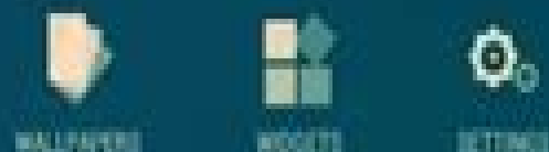
WALLPAPER WIDGETS SETTINGS