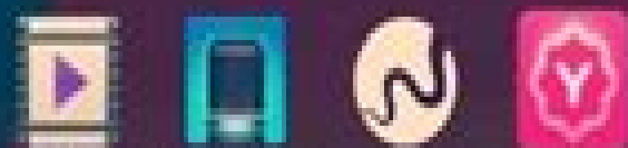
Video Player Voice Recorder WhatsApp Yola