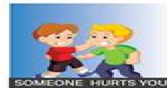
SOMEONE HURTS YOU