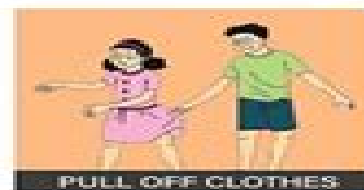
PULL OFF CLOTHES