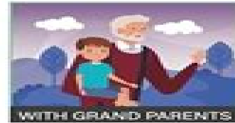
WITH GRAND PARENTS