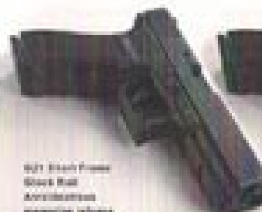
GLOCK 21 Short-Frame Ambidextrous magazine release

GLOCK MB handgun with ambidextrous magazine release. After the initial conversion of a magazine release that can be activated by either the right or thumb of the shooting hand. The new magazine designed for the ambidextrous user. The magazine is attached to the slide. The slide magazine will not work in pistols not fitted with the ambidextrous magazine release.