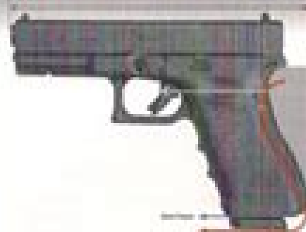
GLOCK 21SF ® Short-Frame