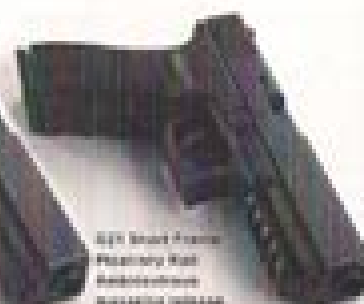
GLOCK MB Short-Frame Ambidextrous magazine release