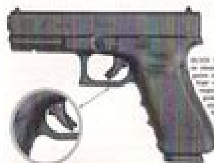
GLOCK MB Ambidextrous magazine release

The information in this manual is provided as a guide only. It is not intended to be a substitute for the actual manual provided with the product. Please refer to the actual manual for complete information.