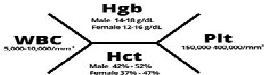
Complete Blood Count - CBC