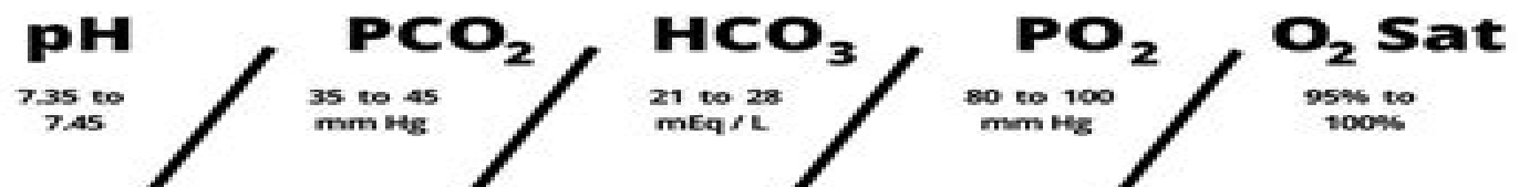
Arterial Blood Gas (ABG)