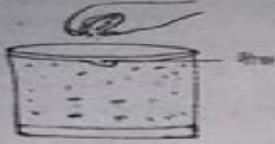
চিত্র : ১