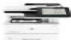
HP LaserJet Enterprise MFP M527dn

Finish key tasks faster with an MFP that starts right away and helps conserve energy. 1 Multi-level device security helps protect from threats. Original HP Toner cartridges with JetIntelligence and this printer produce more high-quality pages. 3