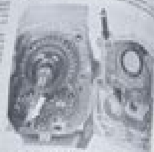
Fig. 18-11. Detail of the winding mechanism of the watch movement, showing the winding crown and the winding wheel.

The winding mechanism of the watch movement is a complex assembly of parts. It includes the winding crown, the winding wheel, the winding pinion, the winding gear, the winding ratchet, the winding click, the winding spring, and the winding lever. The winding mechanism is responsible for winding the mainspring, which stores the energy needed to power the watch movement. The winding mechanism is located on the back of the watch case, and it is accessible through the winding crown. The winding mechanism is a critical component of the watch movement, and it must be carefully designed and assembled to ensure reliable operation.