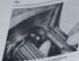
Fig. 18-10. Detail of the winding mechanism of the watch movement.

The winding mechanism of the watch movement is a complex assembly of parts. It includes the winding crown, the winding wheel, the winding pinion, the winding gear, the winding ratchet, the winding click, the winding spring, and the winding lever. The winding mechanism is responsible for winding the mainspring, which stores the energy needed to power the watch movement. The winding mechanism is located on the back of the watch case, and it is accessible through the winding crown. The winding mechanism is a critical component of the watch movement, and it must be carefully designed and assembled to ensure reliable operation.