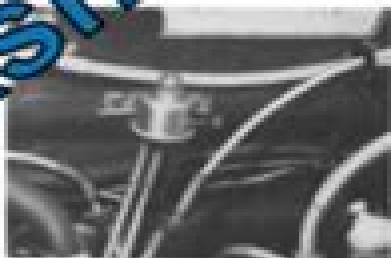
Fig. 8 Model 126