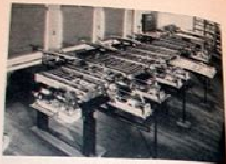
The differential analyzer.