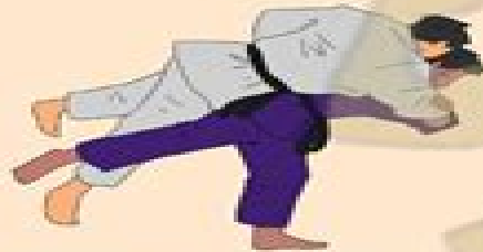
HARAI GOSHI (払腰)