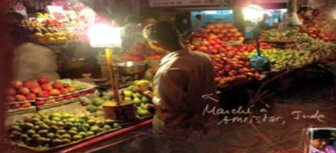
← Marché à Amritsar, Inde