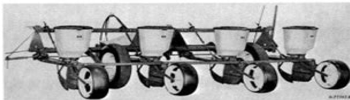
56 Corn Planter (Four-Row)