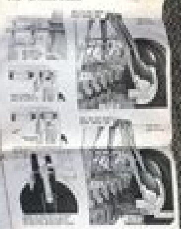
STEP 6. WIRE