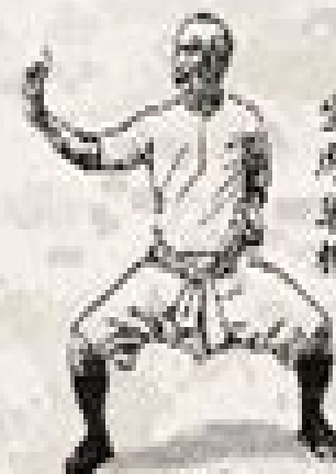
Deing Kiu "Nailing Bridge"