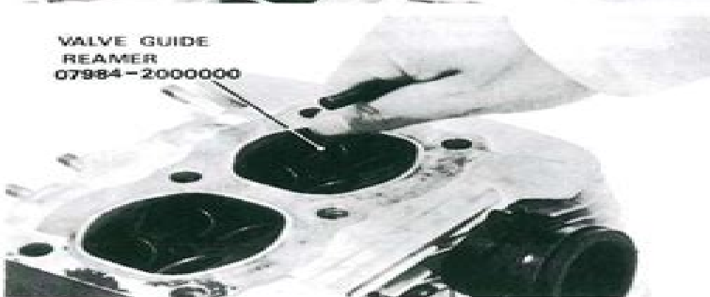
VALVE GUIDE REAMER 07984-2000000