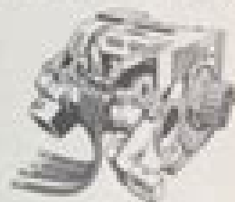
Traction Motor Fig. 1-4

Four Model D27 traction motors, Fig. 1-4, are used in each unit, mounted one on each axle. Each motor is geared to the axle, which it drives, by a motor pinion gear meshing with an axle gear. The ratio between the two gears, Fig. 1-5, is expressed as a double number such as 62/15. In this case the axle gear has 62 teeth while the pinion has 15 teeth.