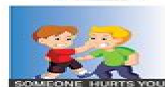
SOMEONE HURTS YOU