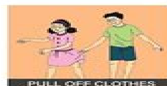
PULL OFF CLOTHES