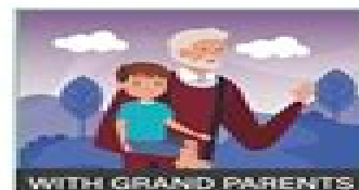
WITH GRAND PARENTS