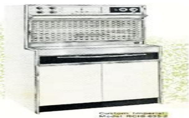
Custom Imperial Model RCIB-635-2