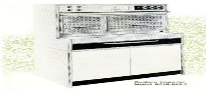
Custom Imperial Model RCIB-645-2