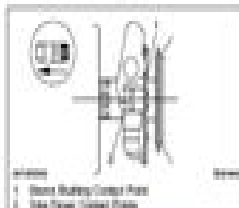
Fig. 2 Grease Fitting Grease Fitting 1. Grease Fitting/Grease Fitting See Figure Grease Fitting