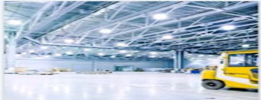
Industrial Engineering & Production Management