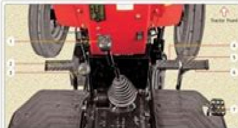
Operator's Front Side Controls