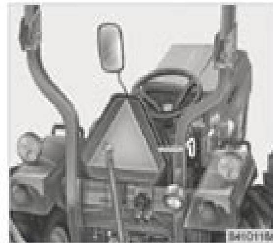
(1) SMV Emblem

2. Always slow the tractor before turning. Turning at high speed may tip the tractor over.