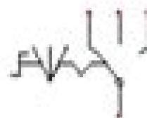
3 positions switch steady on left