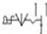
3 positions switch with key, including stop steady on center