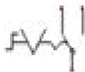
2 positions switch steady on left