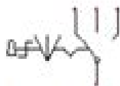
3 positions switch with key steady on right