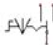
3 positions switch including stop steady on center