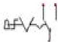
2 positions switch with key steady on right