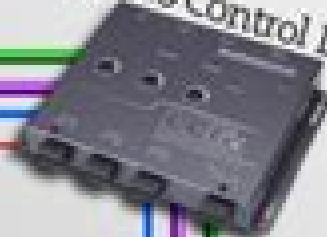
Audio Control LC6i