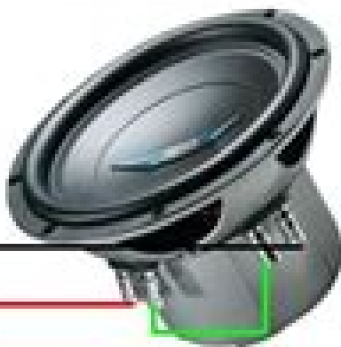
Image Dynamics ID8v3 D4 Impedance: Dual 4 ohm Frequency response: 5Hz-110Hz RMS Power: 50 - 350 Watts