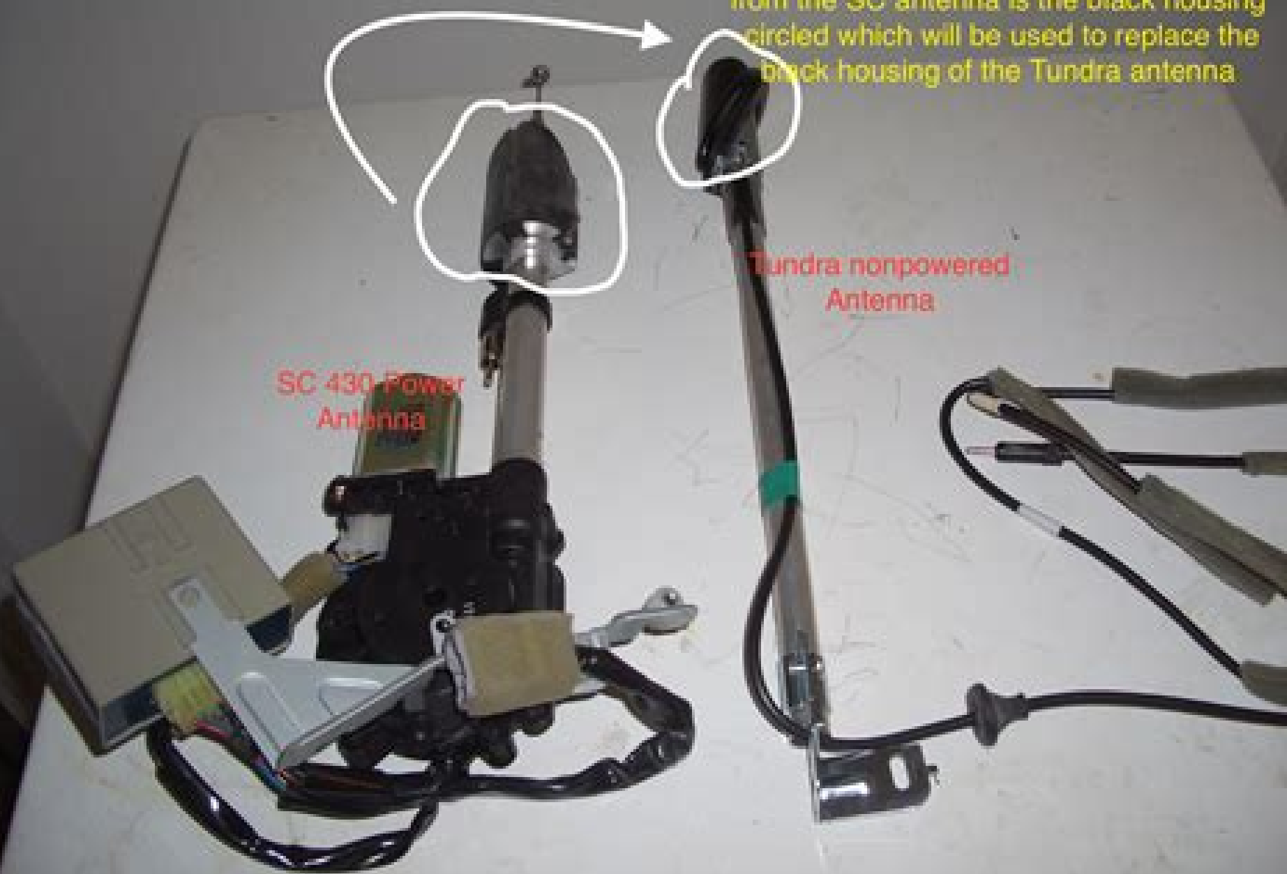
Tundra nonpowered Antenna