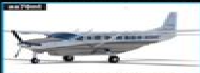
2013 Cessna Grand Caravan EX 867 SHP PTE-140 w/ Improved Lighting, Interior & More. West Coast's Only New Caravan ASR! $2,149,000 Base

Pacific Air Center is your CESSNA Factory Authorized Dealer See Our Quality Pre-Owned Inventory At www.pacaircenter.com