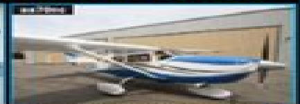
2006 Cessna Turbo 306H Stationair 280 TT, Like New, Low Time, Excellent Condition, G1000, VGa, Always Hangared. $399,000