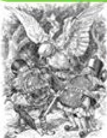
MILITARY FOR NATIONS