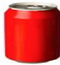
a glass of soda a can of soda