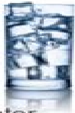
water sparkling water