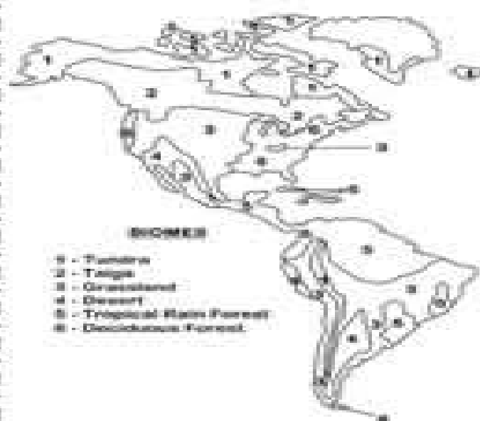
The Earth's 6 Major Biomes

Everywhere you go, you are in a Biome. Scientists have divided our Earth into different regions named biomes. However, not all scientists agree on the number of biomes and we will focus on the six major biomes which are: Deserts, Grasslands, Deciduous Forests, Tropical Rainforests, Taiga, and the Tundra. Each biome has its own unique climate, plant and animal species. Each Biome has its own distinct community of weather, plants and animals who all adapt to their specific biome. Biomes are like ecological communities classified by both living and non living components. The main factors that determine the biome are latitude, altitude, soil, temperature, precipitation, sunlight, plants and animals.