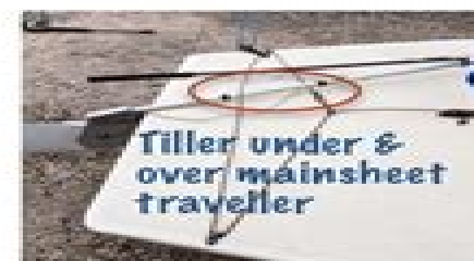
Tiller under & over mainsheet traveller