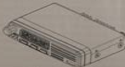
4 channel version

YAESU MUSEN CO., LTD. 1-20-2 Shimomarucho, Ota-Po, Tokyo 145-8545, Japan