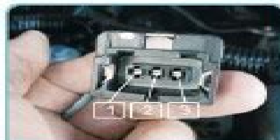
Terminal elétrico do sensor CKP