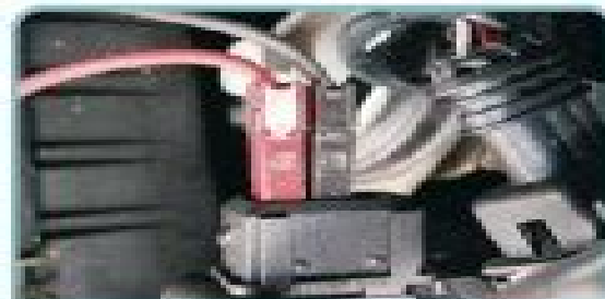
F.1.1 - Procedimento de medida de tensão de resposta do sensor CKP