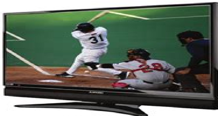
LT-46149 Shown on Included Base