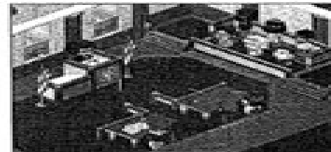
Which roles do you recognize?

The trial court is the first court to hear a case. Both the state and federal systems have trial courts. In the Federal system, the trial court is called a District Court. In the trial court, lawyers use evidence to try to prove that their client's side of the story is what really happened. Evidence can be almost anything—witnesses, videos, photographs, a letter, a piece of fabric, or even a murder weapon! In a jury trial , a group of twelve people listens to the evidence and decides who wins the case. That decision is called the verdict . In a bench trial there is no jury, so the judge gives the verdict.