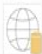
Custom web app

Suggested searches: Assets Business Contacts Employees Inventory Project Sales