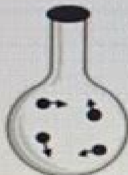
Figure 1: Gases in a Nonflexible Container