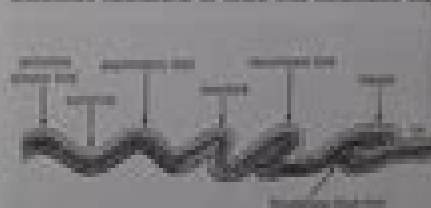
Fig. 19 Types of folding.

is formed (Fig. 19). If it is pushed still further, it becomes a recumbent fold (Fig. 19). In extreme cases, fractures may occur in the crust, so that the upper part of the recumbent fold slides forward over the lower part along a thrust plane , forming an overthrust fold . The over-riding portion of the thrust fold is termed a nappe (Fig. 19). Since the rock strata have been elevated to great heights, sometimes measurable in miles, fold mountains may