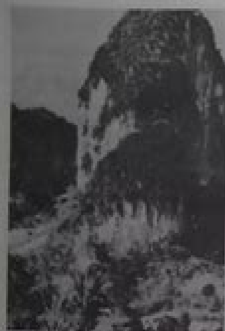
An isolated limestone hill near Kuala Lumpur. Compare this hill with the limestone features shown in Chapter 7. Johnston Perseus