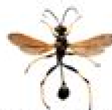
Mud-daubers (2 to 3 cm) Petiole connecting abdomen and thorax is long and thin