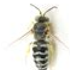
American sand wasp (2.5 to 4 cm) Wave-like banding Bright yellow legs and greyish banding