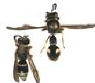
Potter wasps (1 to 2 cm) Smaller, more slender Hooked abdomen and narrow waist