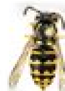
Northern aerial yellowjacket (1 to 2 cm) Bright yellow legs, brighter banding