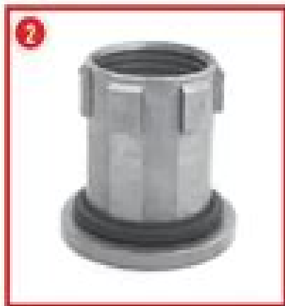
392302 - Bushing Die LNL 392303 - O-Ring LNL