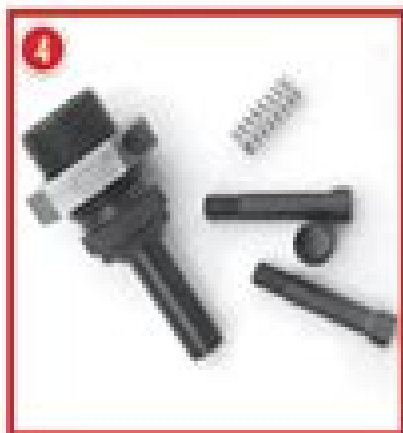
050007 - Ram Prime System 50 BMG