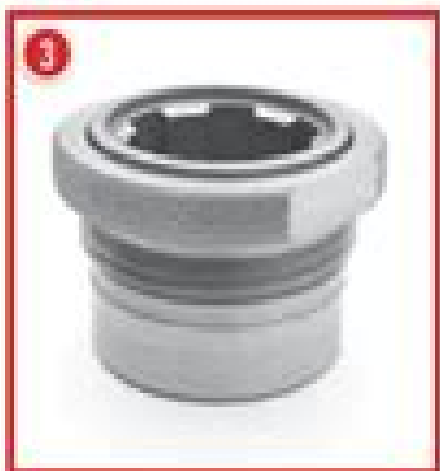
398118 - Bushing Adapter 50 Cal 392301 - Press Bushing LNL