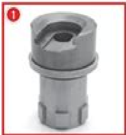
390585 - Shell Holder #50 392302 - Bushing Die LNL 392303 - O-Ring LNL