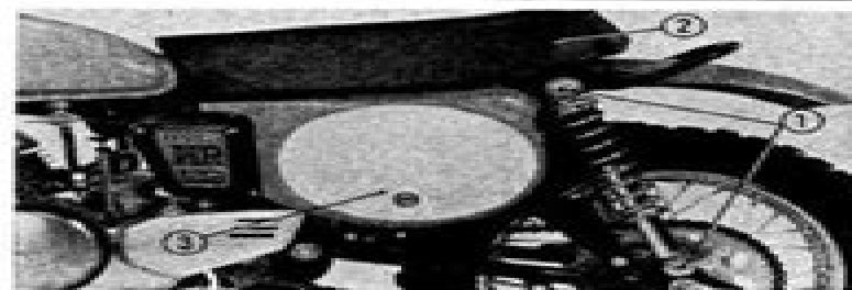
Fig. 4-49 (1) Rear shock absorber securing nut (2) Seat (3) Side cover