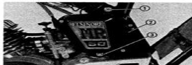
Fig. 4-51 (1) Bolt (2) Air cleaner case (3) Nut