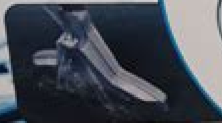
Wash & Dry - Carpets & Upholstery