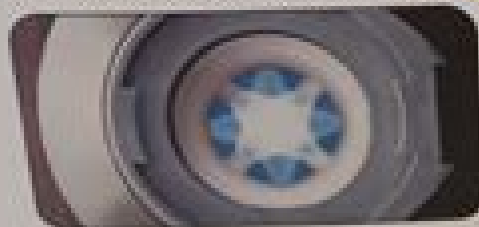
Patented Water Injection Filter