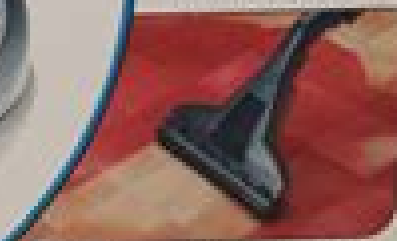
Wash & Dry - Hard Floors