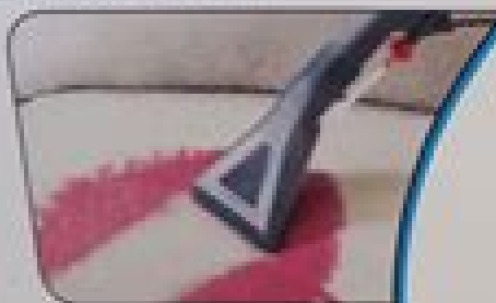
Cleans Up Accidents