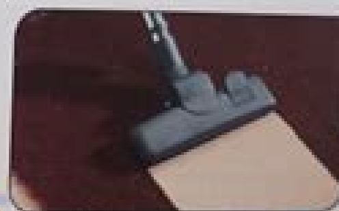
Power Vacuum - Wet & Dry