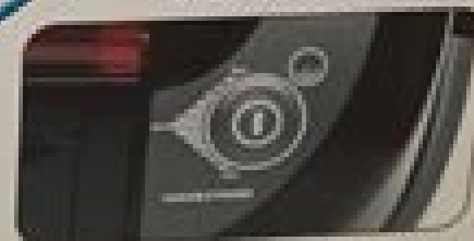
Adjustable Suction Power