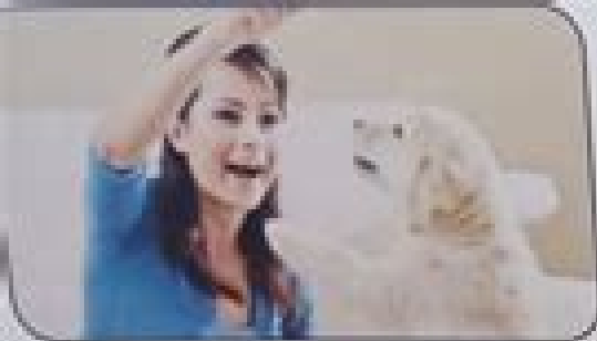
Removes Pet Hair