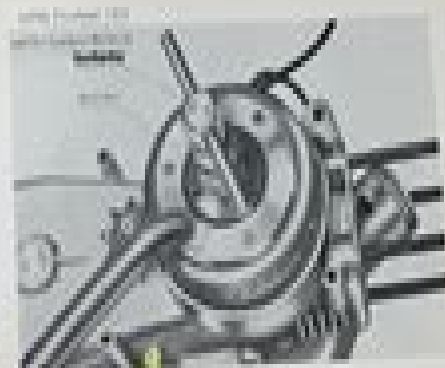
Fig. 2 - Remove the piston rod from the pump head and the piston rod is shown in Figure 2.