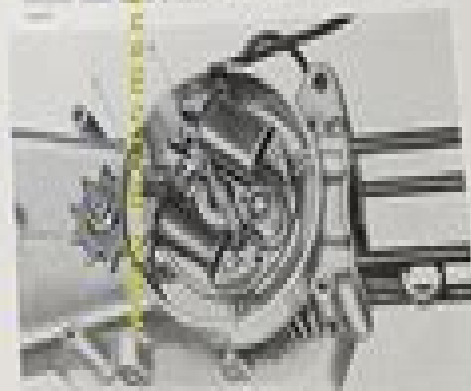
Fig. 3 - Remove the piston rod from the pump head and the piston rod is shown in Figure 2.