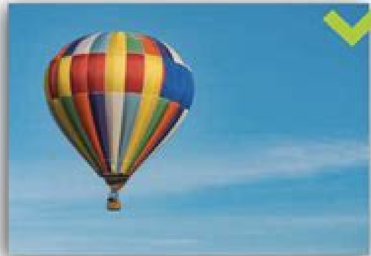
Printed Version with Correct Bleed