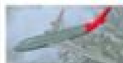
Boeing 747-400 Global Freighters