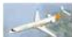
Bombardier CRJ700 Orbit Airlines