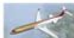
Bombardier CRJ700 Pacifica Airlines