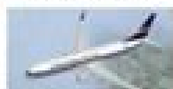
Boeing 737-800 World Travel Airlines