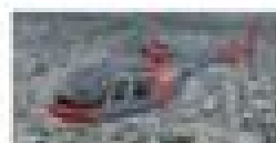
Bell 206B JetRanger Norwegian Air-Sea ...