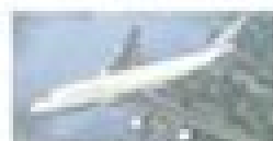
Boeing 747-400 White