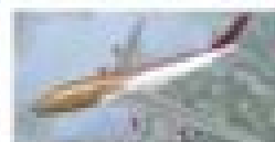
Boeing 747-400 Pacifica Airlines