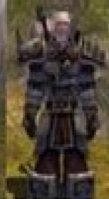
Plate Mail Suit