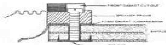
FIGURE 9 Front Mounting Detail (Not to scale)

By applying the work of Thiele and Small, Electro-Voice engineers developed a computer program which easily, quickly, and