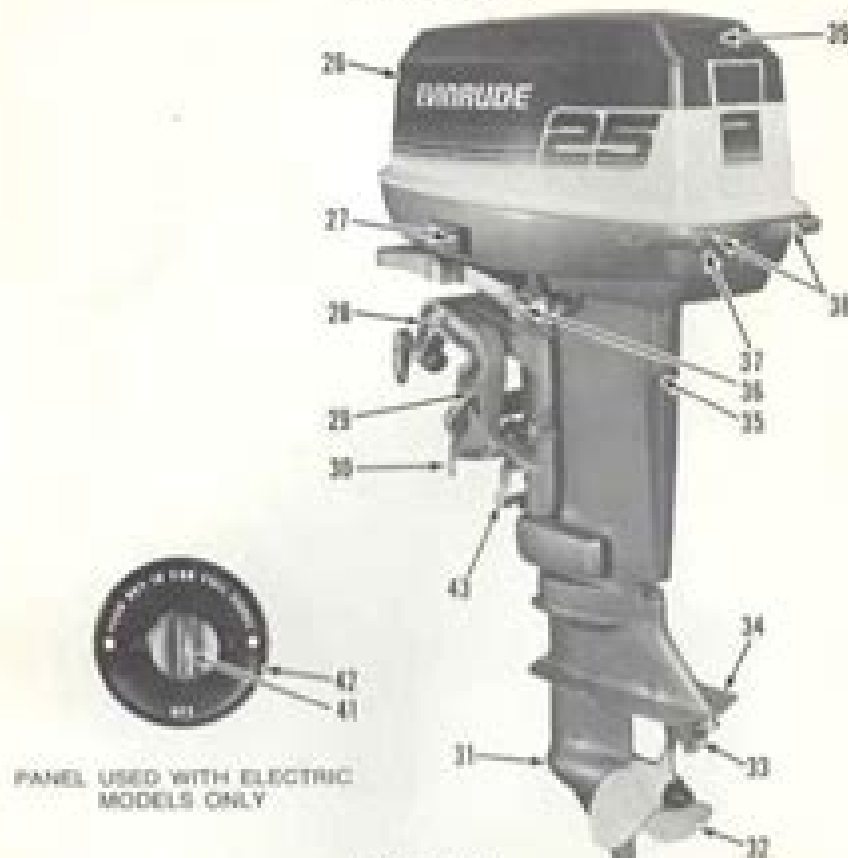
PANEL USED WITH ELECTRIC MODELS ONLY