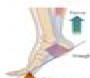
Class 2 lever