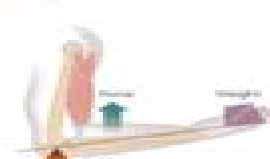
Class 3 lever

Bones are classed as levers on a fixed point, or fulcrum. Force is applied against a load on a weight. A bone, composed of muscle and bone as a point, can change the direction, speed and distance of movement. Class 1 levers change the direction of the bone, and act as a fulcrum. Class 2 levers can move a larger load, but both speed and distance are reduced. Class 3 levers move the weight in the same direction as the bone. The gain in distance traveled and speed, but loss of force is required.