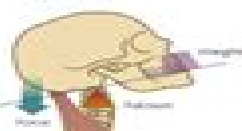
Class 1 lever